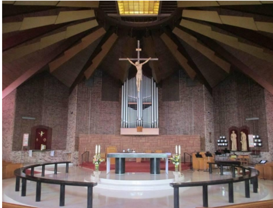
St. Pius X Church in Tulsa, Oklahoma.